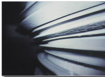
■ Vessel — Collapsed catalyst bed