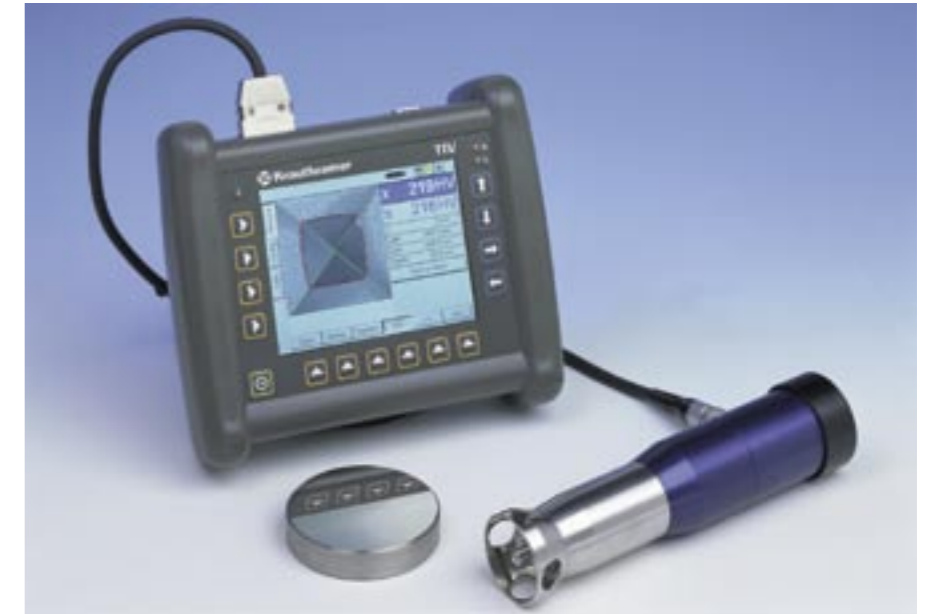
The TIV hardness tester with probe and hardness reference block. The probe contains high-tech features – the optical system and the CCD camera enable viewing through the diamond. Direction independence is also a proof of the patented Krautkramer technology: you can measure in any direction – without any additional settings.

The color LCD of the TIV hardness tester does not only show you the image of the diamond's indentation but also the directly displayed reading in the selected hardness scale. The graphic user interface shown on the display is adapted to the known Windows standard. In this way, you will swiftly have a good grasp of how the instrument should be operated, irrespective of if you want to configure, measure, evaluate, or store. The special extra: You do not need a mouse to select functions because the instrument has a touch screen capability using a pen. However, as an alternative, conventional pushbuttons are also available for most of the functions.