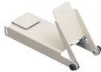
Instrument carrier and prop-up stand MIC 1040