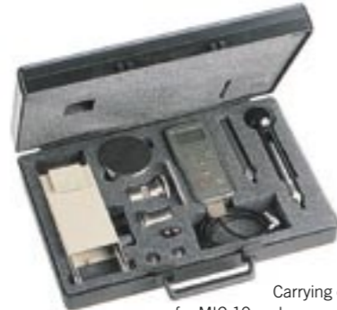
Carrying case for MIC 10 and accessories