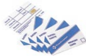
Memory cards for the storage of measurement and calibration data as well as report formats