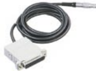
Serial data cable for printer and PC